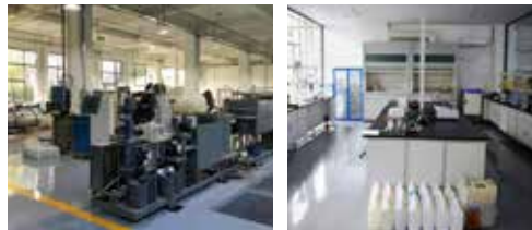
• Workshop of the R&D Center

Beijing R&D Center focuses on the development of the Three Wastes (flue gas, sewage and solid waste) treatment process and reagents, new energy and new materials. Beijing R&D Center is fully equipped with good basic conditions. It has 4 independent small test sites, 1 public test site, 1 aseptic laboratory, 1 3D printing mechanics laboratory, 1 large-scale pilot plant test site, office area and warehouse.